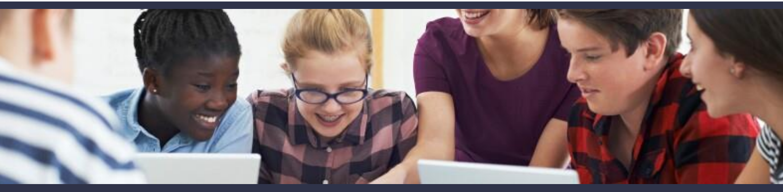
St Joseph's Catholic College Aberdeen BYOD Portal Order Online at <a href="https://sicca.orderportal.com.au">https://sicca.orderportal.com.au</a>